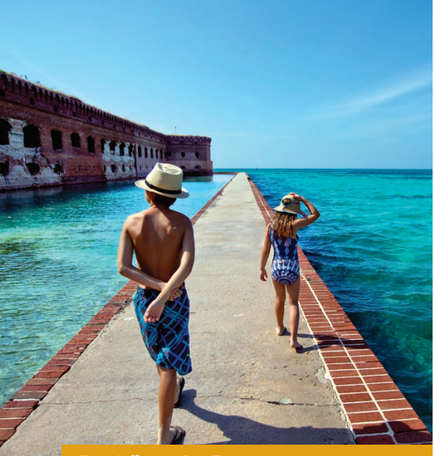
Fort Jefferson Dry Tortuga Caption TK

some of the most scenic beaches in the state.