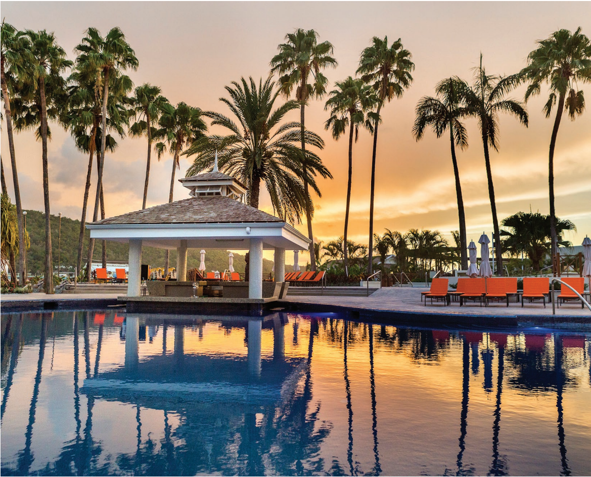
A pool and swim-up bar at Moon Palace Jamaica Grande Palace on the north coast of Jamaica.

For the ultimate luxury vacation experience, check-in to The Grand at Moon Palace Cancún, a new resort within a resort debuting at Moon Palace Cancún in February 2017. The high-