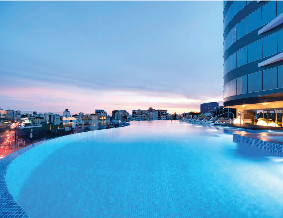
Dawn from the pool at Embassy Suites by Hilton Santo Domingo, Dominican Republic.