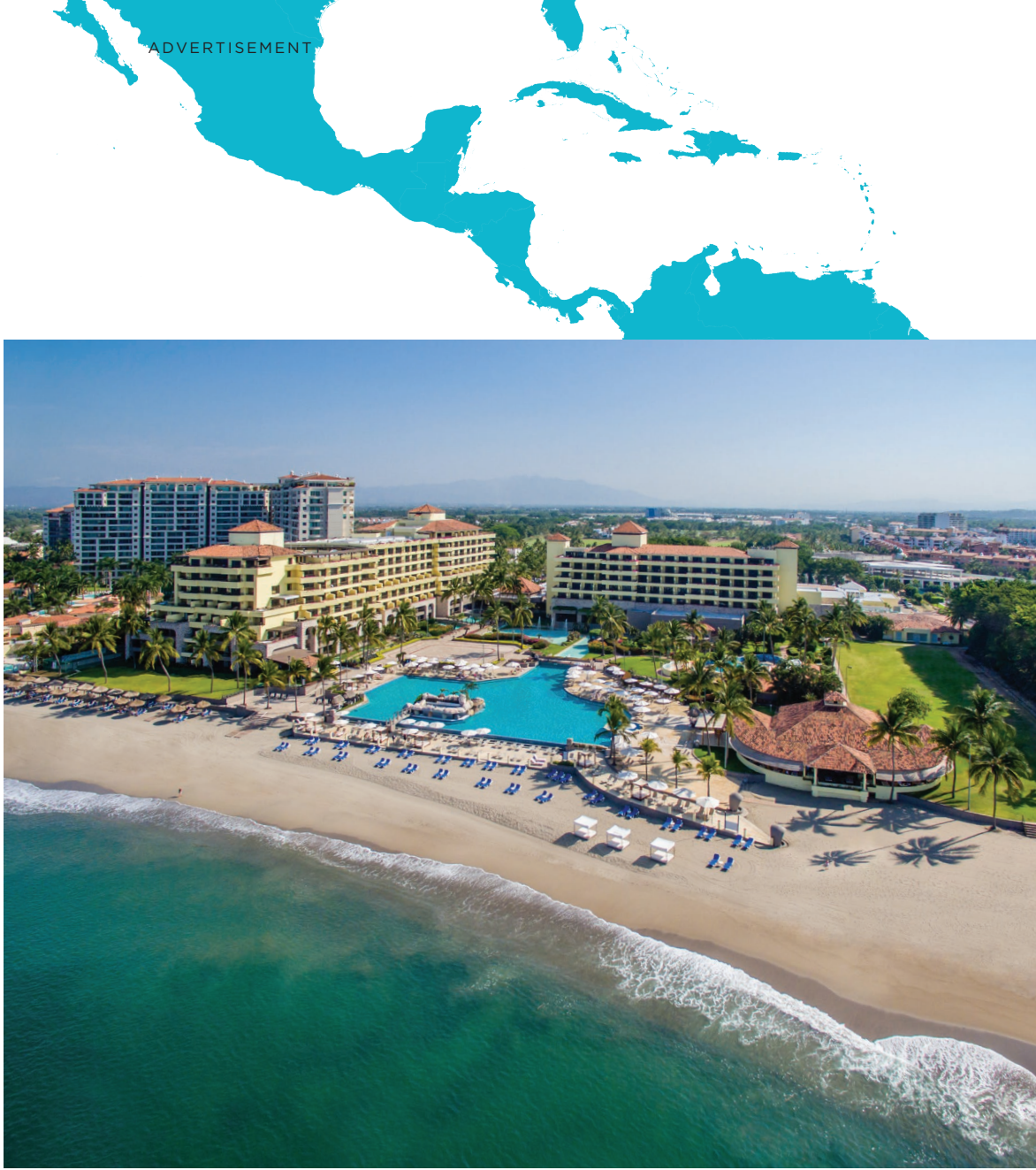
The CasaMagna Marriott Puerto Vallarta Resort and Spa.

A playground retreat for all generations, Aruba Marriott Resort & Stellaris Casino features an upscale hotel within a hotel, and the most spacious rooms on the island. Aruba is famous for its seafood, so spend your credit on a delectable fresh seafood meal at the resort's Atardi restaurant such as Tuna Carpaccio, Blackened Mahi Mahi or Macademian Grouper.