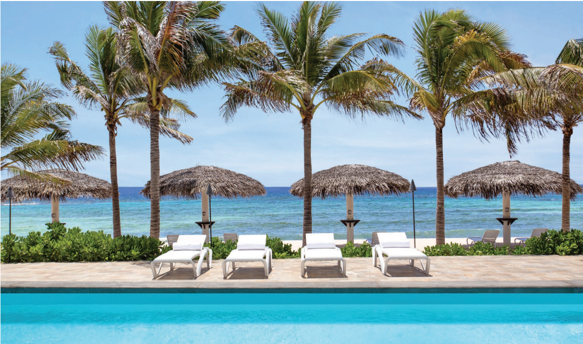
Beach Soleil, the exclusive beach club of Le Soleil d’Or, on Cayman Brac.

The Cayman Islands is just over an hour from Miami (with nonstop flights available from most major cities), but a world away from the expected. A fabulous destination year-round — and particularly during the cold, grey Northeast winter — Cayman offers new high-end accommodations, bespoke activities and world-class fare that have made it a go-to spot for the luxury traveler.