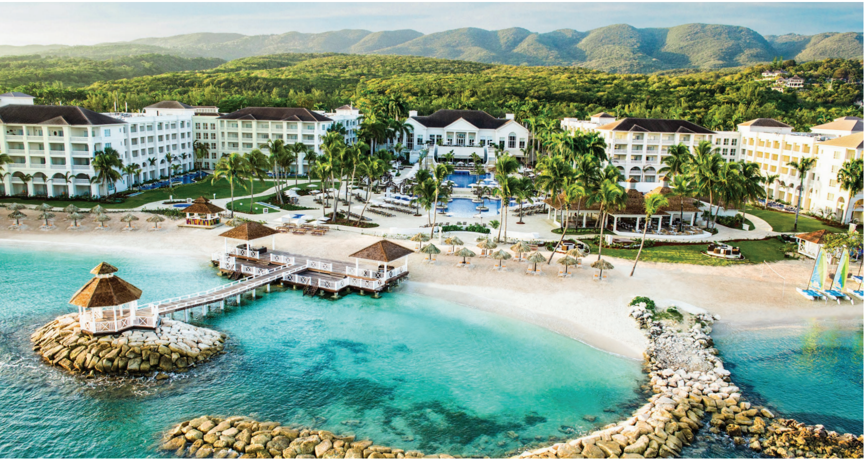
The Hyatt Zilara and Hyatt Ziva Rose Hall all-inclusive resorts in Montego Bay, Jamaica.