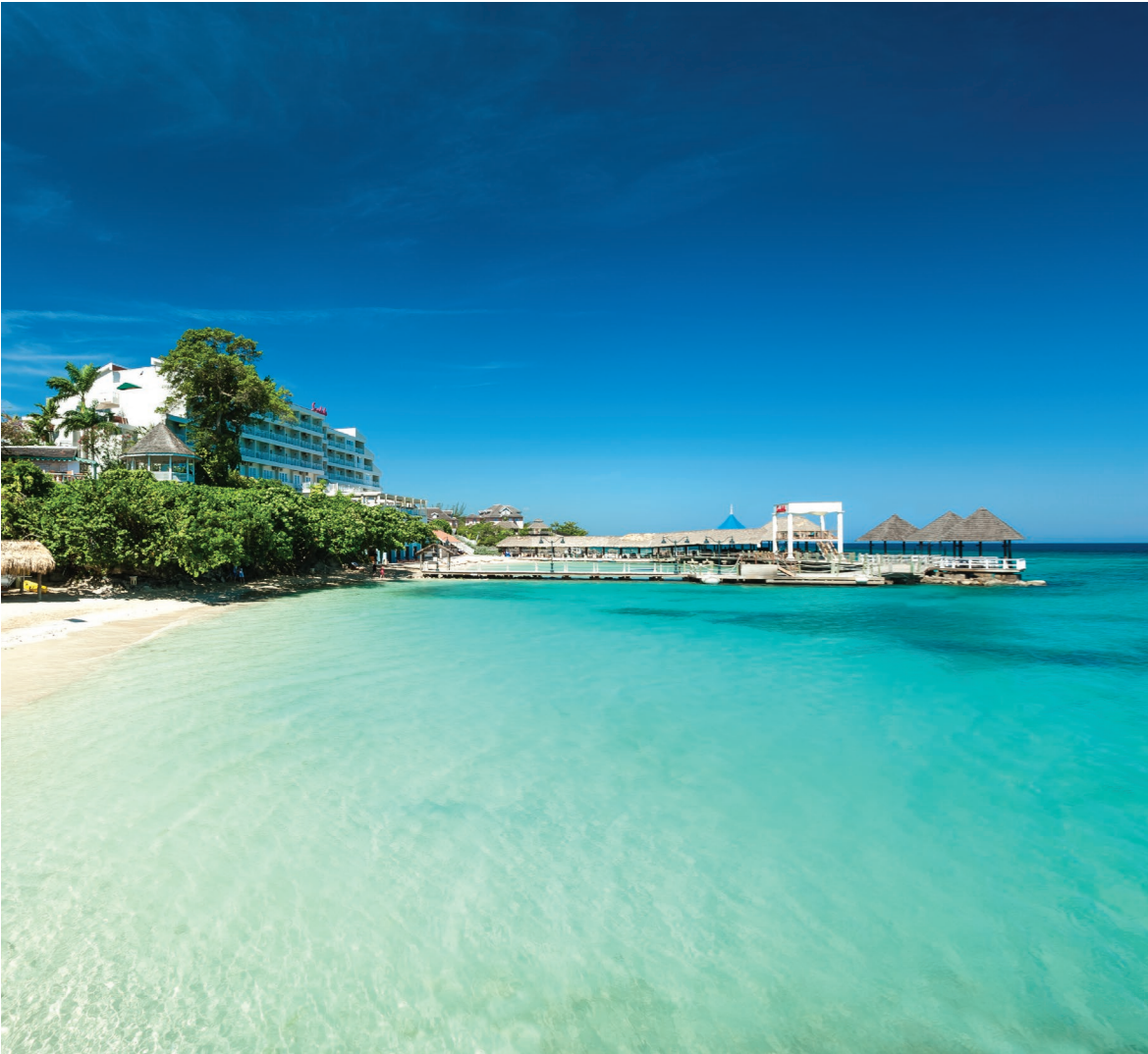
Sandals Ochi Beach Resort in Ocho Rios, Jamaica.

At Sandals Ochi Beach Resort in Ocho Rios, travel to another era at The Rabbit Hole, the Caribbean’s first Roaring 20s-style speakeasy. Whisper the correct password at the secret door for exclusive entry, and find yourself in a cool, retro lounge, where the waitresses wear flapper dresses, the bartenders are dressed in derby hats and three-piece suits, and the Art Deco-style décor is an ode to Alice in Wonderland. Dance the night away to jazz and blues, and sip a cocktail or martini representing the best of the era — from the elegant Sidecar to the tangy Bee’s Knees. With six liquor brands not available anywhere else on the resort, The Rabbit Hole adds a unique air of mystery to your Luxury Included Vacation.