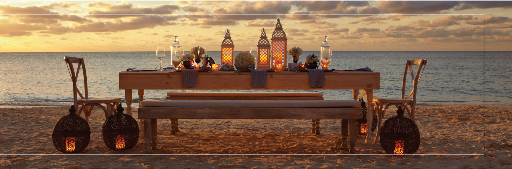
Seaside dining at the Grand Cayman Marriott Beach Resort in the Cayman Islands.

Puerto Rico has three of the world’s six bioluminescent bays (biobays), where you can swim or paddle through water that actually glows, a surreal phenomenon caused by thousands of micro-organisms. Or visit Rio Camuy Cave Park, and descend 200 feet into the third-largest underground river cave system in the world. See the stars in a whole new way at Arecibo Observatory, home to the largest single-dish radio telescope in the world.